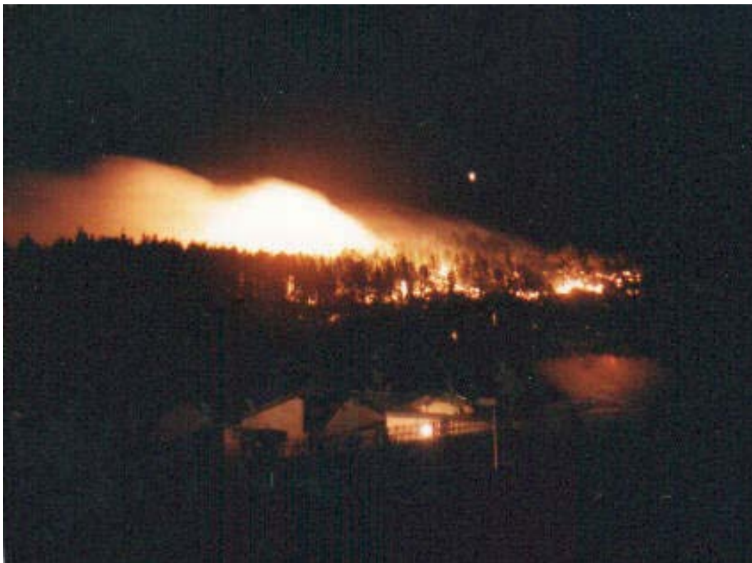
Skyline Drive Fire – June 1988

This plan was made possible through the combined efforts of many people who provided information, data, ideas, analysis, and most importantly, their time. It has been reviewed by state and federal agencies with interest in its content and recommendations. The information presented is based on the most current information available at the time it was published. Ideas for improvement are welcomed and should be forwarded to the Butte County Emergency Manager at 839 Fifth Avenue, Belle Fourche, South Dakota 57717.