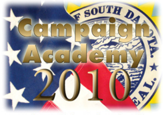
March 16 - Rapid City • March 18 - Sioux Falls

Contact your local electric cooperative for a registration form or call SDREA at 1-800-201-8823.