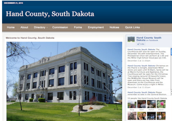
Hand County is one of the 12 counties enrolled in the SDACO County Website Program. Visit the Hand County Website today! www.hand.sdcounties.org